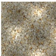
DAMTEC wave 3D