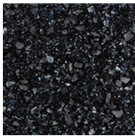
DAMTEC 3D 17/8